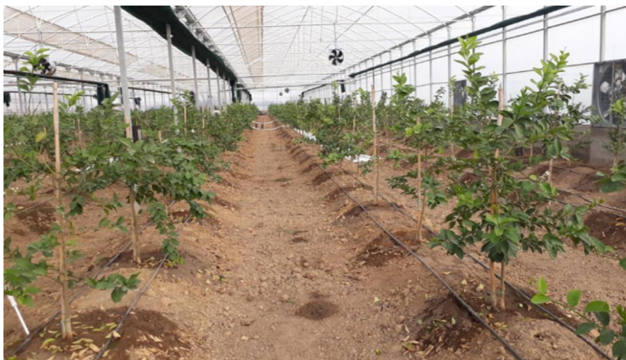
Fig. 1. Cultivating lemons in a modern greenhouse in Mazandaran, Ira