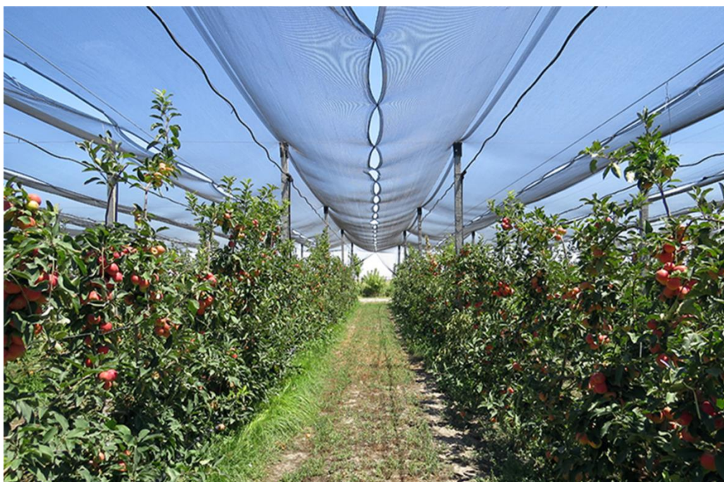
Fig. 2. Cultivating apples under net house in Khorasan Razavi, Iran